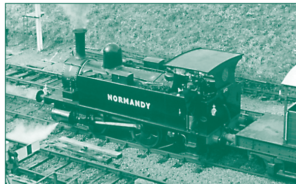
No. 96, Normandy shunting at Horsted Keynes

All the Society's stock is based on the Bluebell Railway, with whom the Society has always had a very good working relationship.