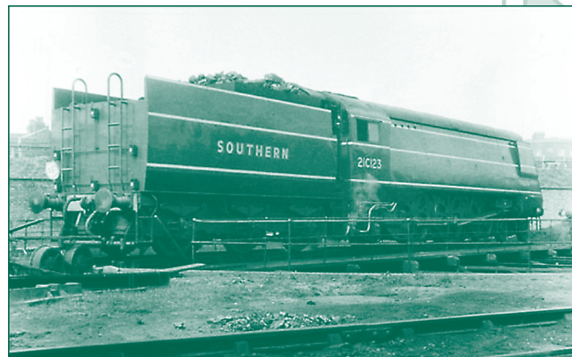
21C123 at Stewarts Lane, 1946.

The locomotive has been withdrawn from traffic due to firebox problems. The steel welded firebox dates from the British Railways era and requires a new inner firebox, costing at least £150,000.